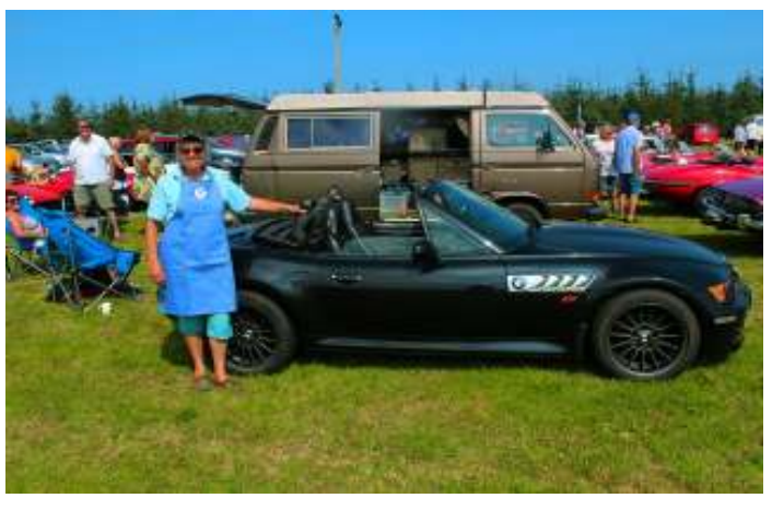
As well as enjoying cars and bikes, there were bacon sandwiches and cream teas on offer that just had to be sampled (and attracted many wasps!)